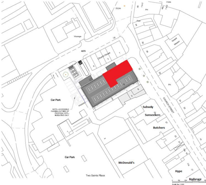
Indicative plan only