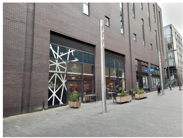
Unit 1 (Seel Street)