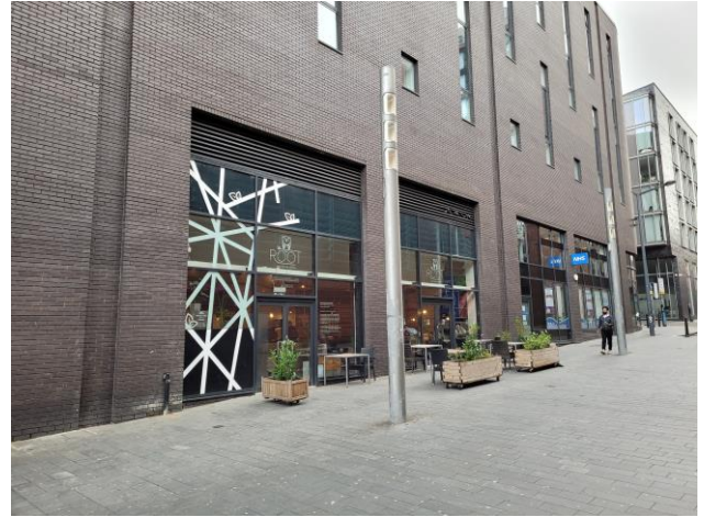
Unit 1 (Seel Street)