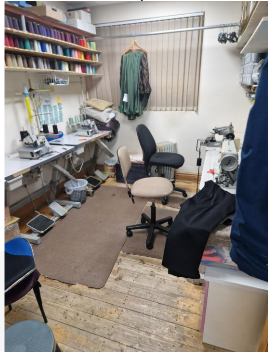
Row Level rear ancillary