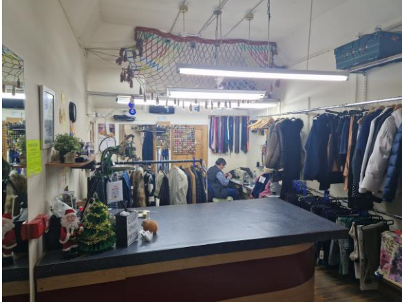
Row Level Sales Area