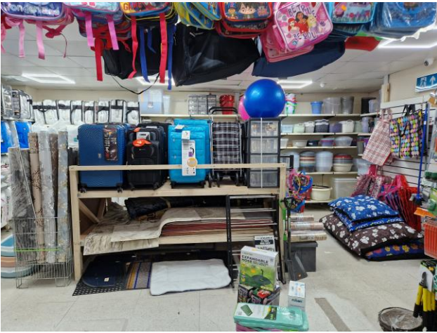
Ground Floor rear